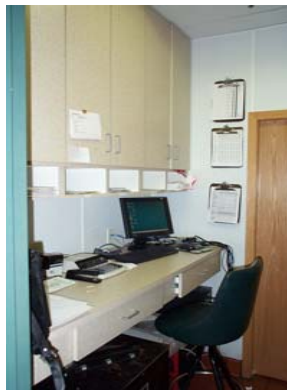
Casework & Solid-surface