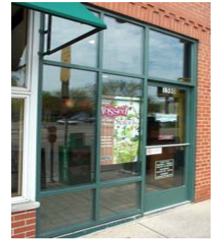
Doors & Storefronts