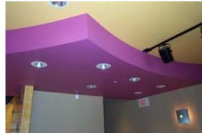
Walls & Ceilings